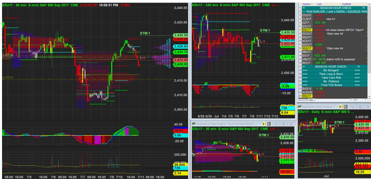
10/7/2017 22:00 - Screen Clipping

Looking if h4 can close below that h4 mpoc which is also last Friday session mpoc and whole prior week mpoc