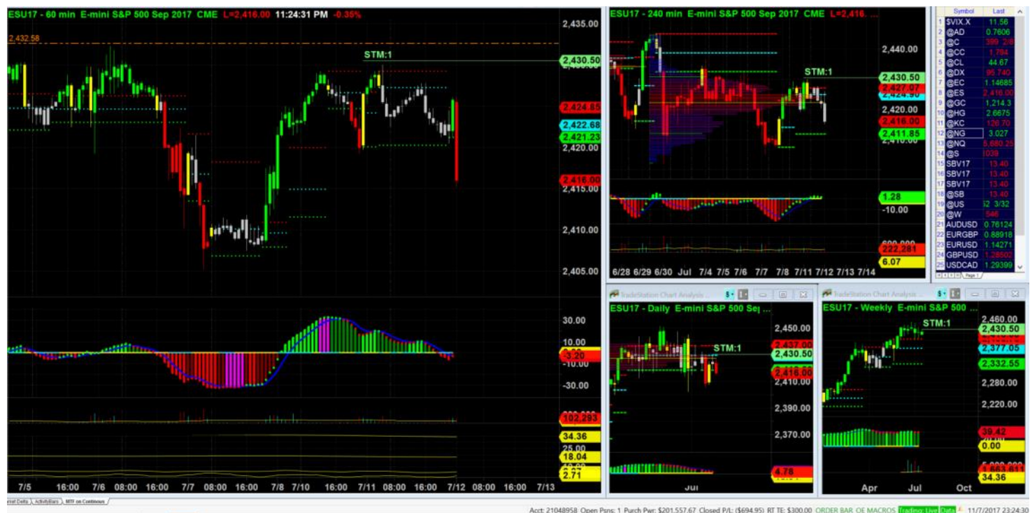
11/7/2017 23:24 - Screen Clipping

Not really what I expect but still this new box is not too bullish so I stay wide of my stop, staying below h1 old plywood and h4 plywood for now