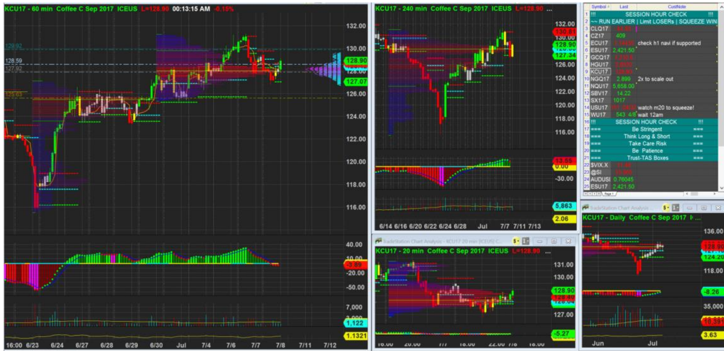
8/7/2017 00:13 - Screen Clipping

Not going to do long for now. H4 no plywood support.