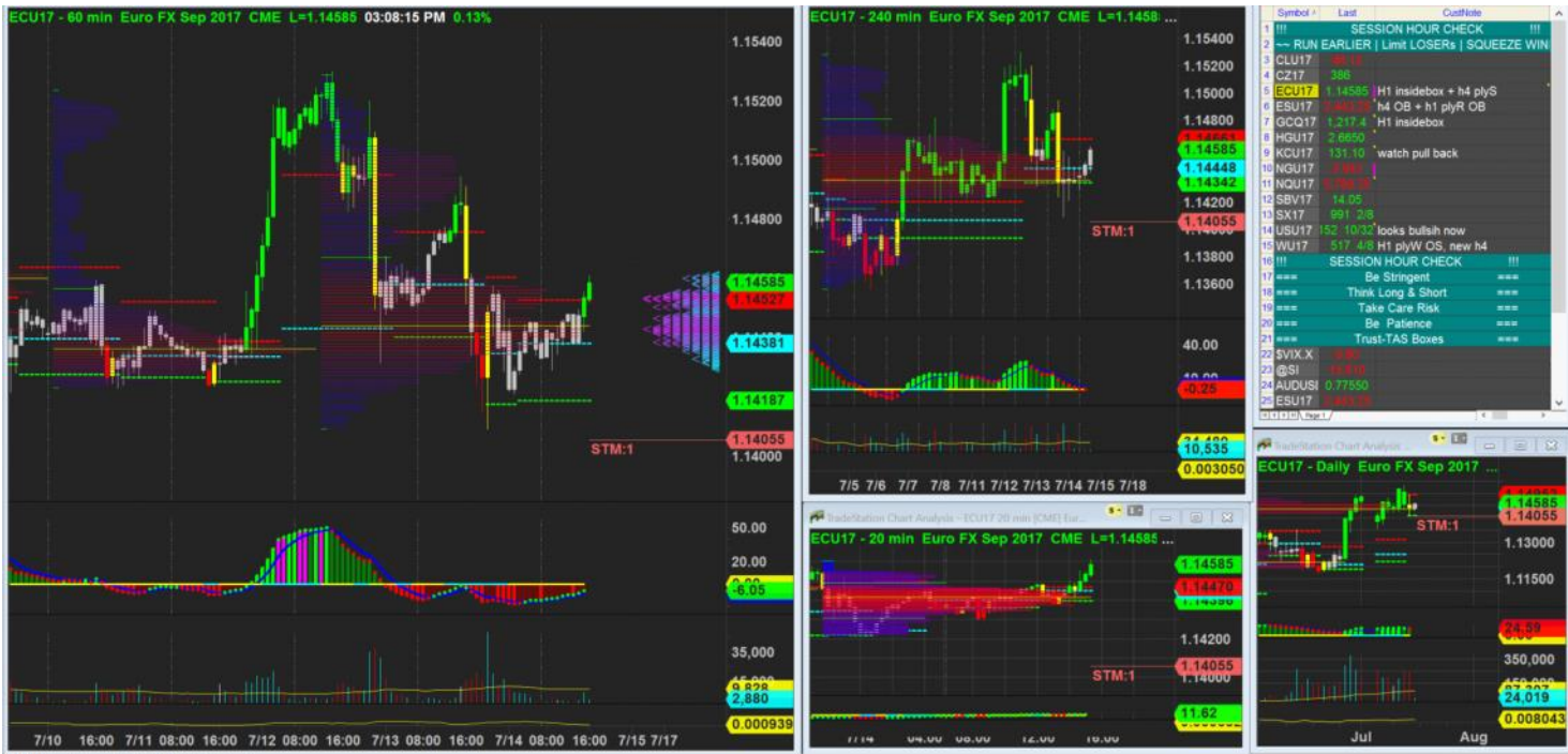
14/7/2017 15:08 - Screen Clipping