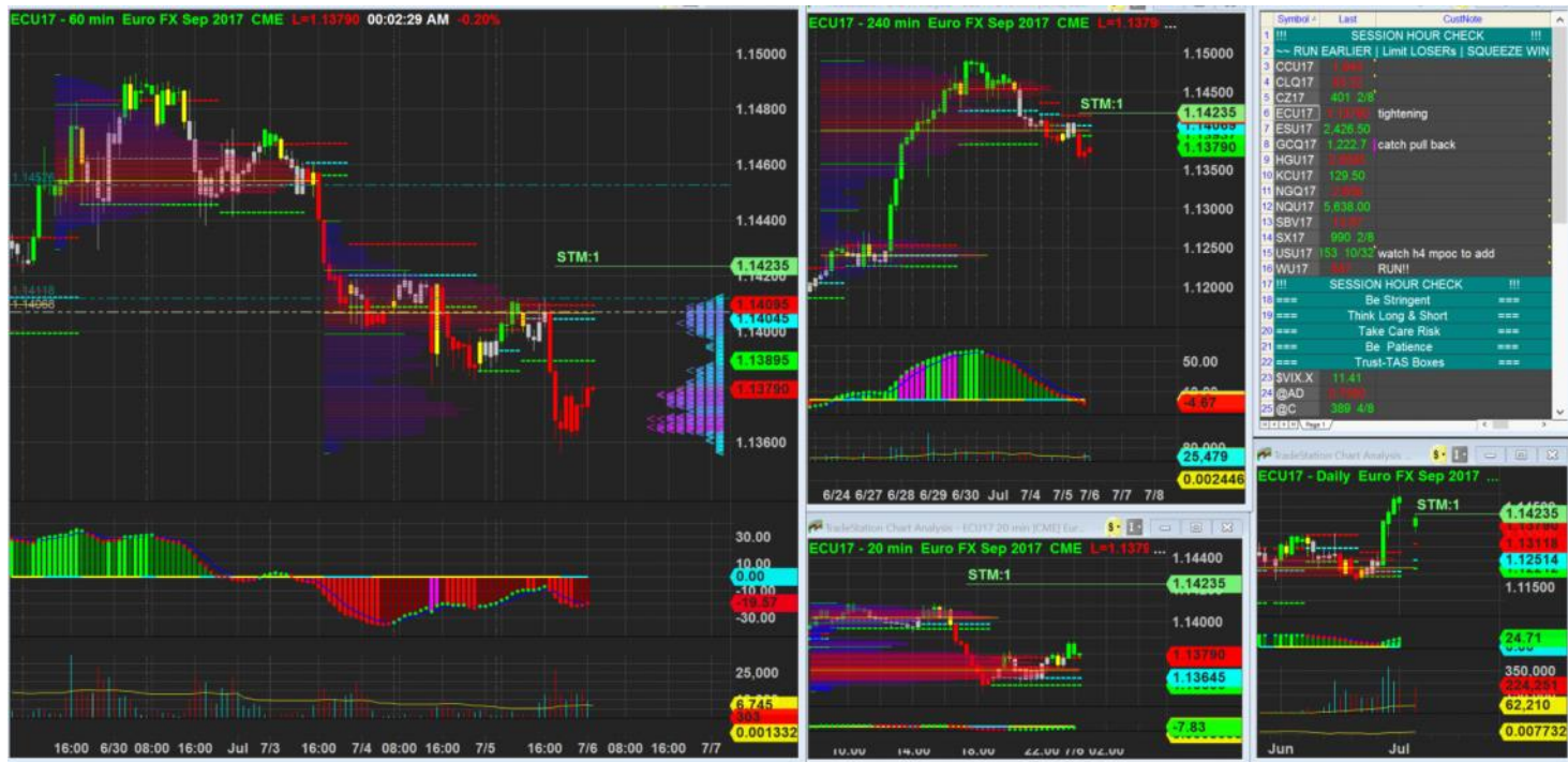
6/7/2017 00:02 - Screen Clipping