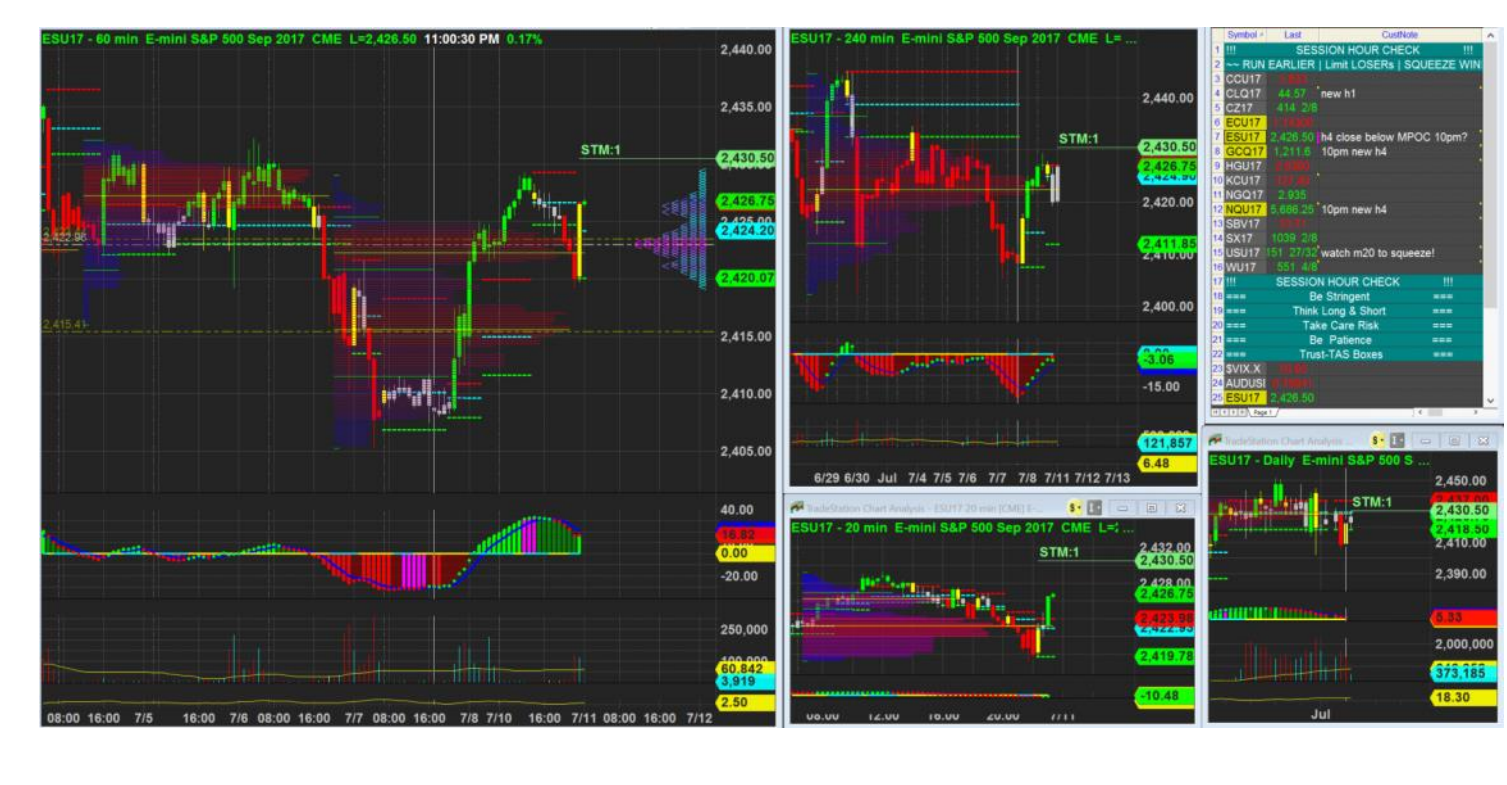
10/7/2017 23:00 - Screen Clipping

There was a plywood resistance flickering before bar close and that would be a nice spot to add on. But too bad in the end the setup didn't firm up bcz of the last min push that breka also m20 plywood resistance.