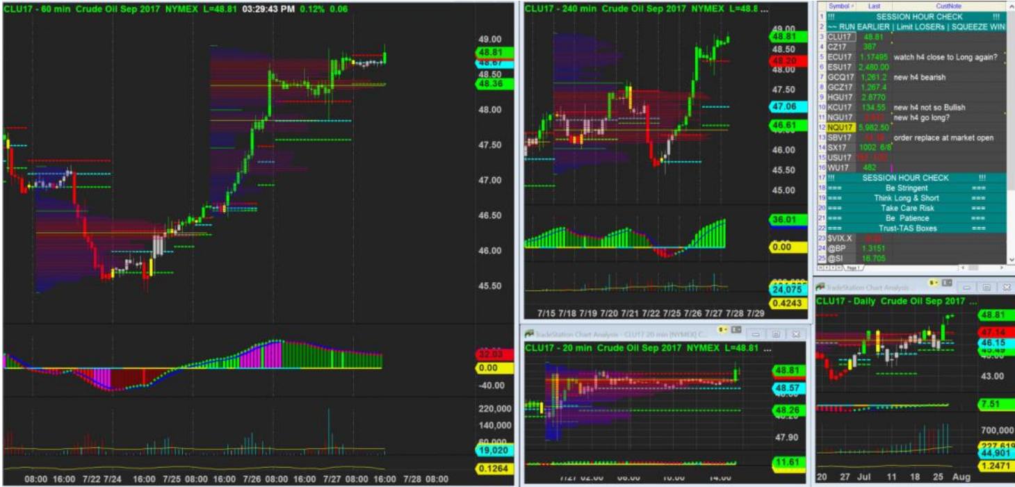
27/7/2017 15:29 - Screen Clipping

Missed by that much. If I m up at 5am then I would hv long.