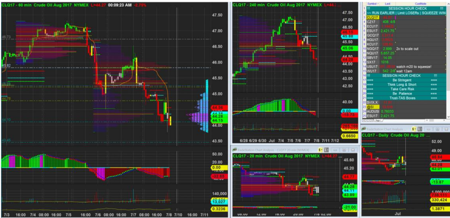
8/7/2017 00:09 - Screen Clipping