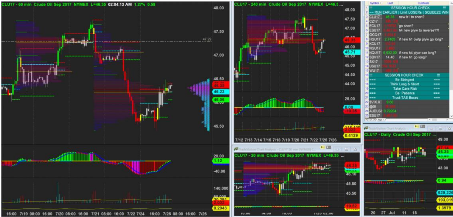
25/7/2017 02:04 - Screen Clipping