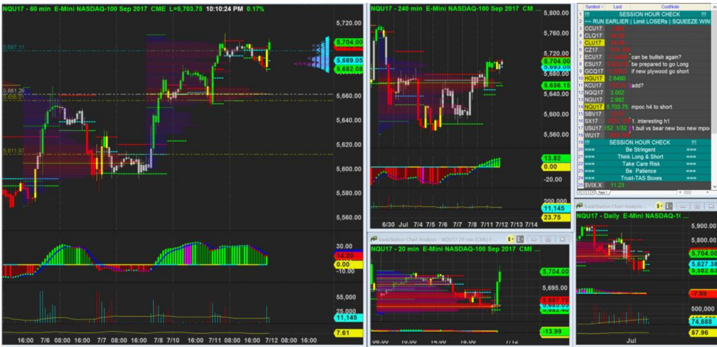
11/7/2017 22:10 - Screen Clipping

Not chasing Long for now waiting for more info