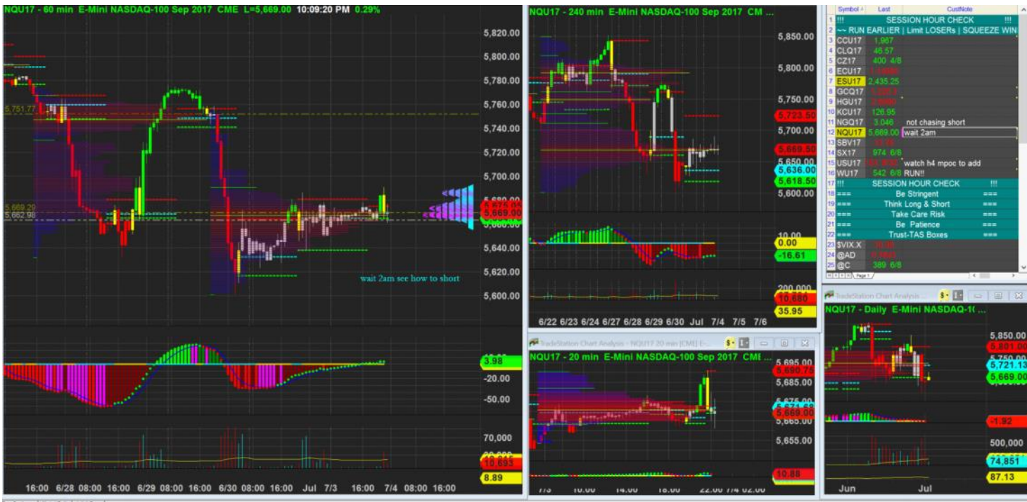
3/7/2017 22:09 - Screen Clipping