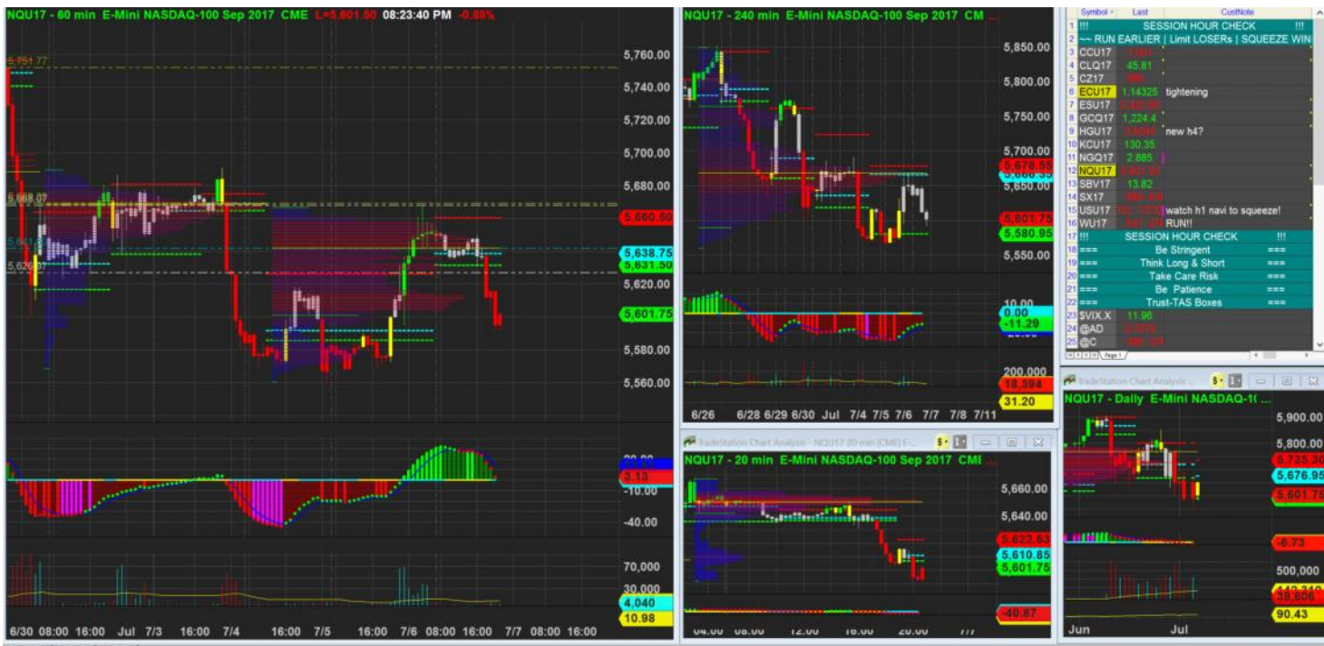
6/7/2017 20:23 - Screen Clipping

Waiting for pull back near 5620 area. Then see how it goes to find short entry