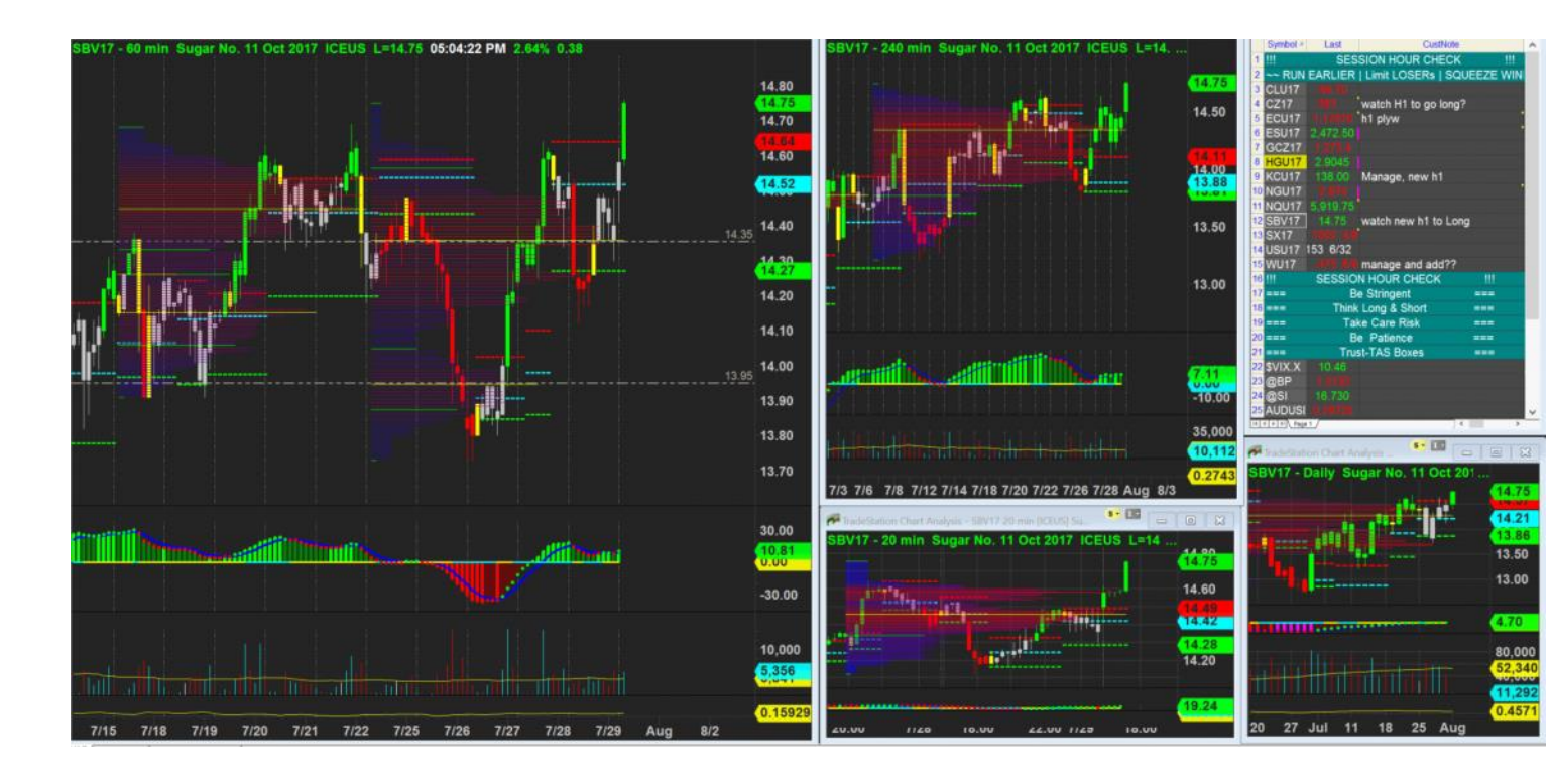
31/7/2017 17:04 - Screen Clipping