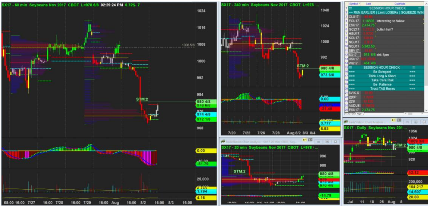
2/8/2017 14:29 - Screen Clipping Didn't scale out, as h4 still got no new box this morning and h4 navi still way to go bfr oversold