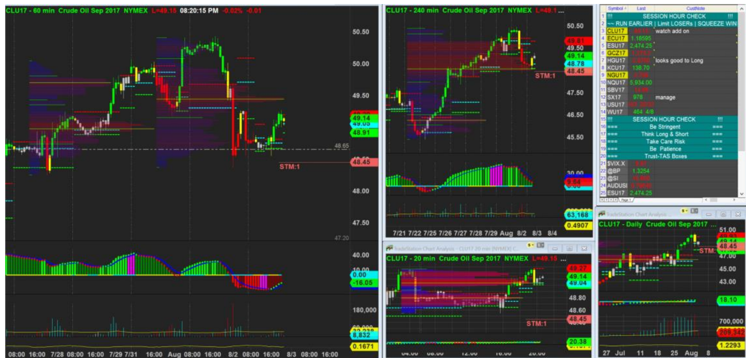
2/8/2017 20:20 - Screen Clipping

Didn't want to add on as even a small risk add-on is not very small the risk. Given this counter h4 trend setup with h4 navi not at perfection ( hitting zero balance line and supported) I will not risk extra lot for now. Waiting for more information.