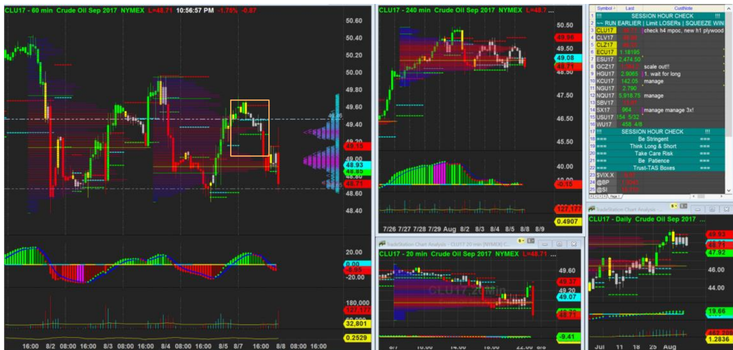
7/8/2017 22:57 - Screen Clipping

FLASHBACK, no short was in consideration.