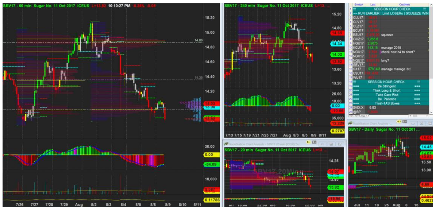
8/8/2017 22:10 - Screen Clipping

Borderline. Will wait for 2nd close see how it goes, as h4 will close 2330,