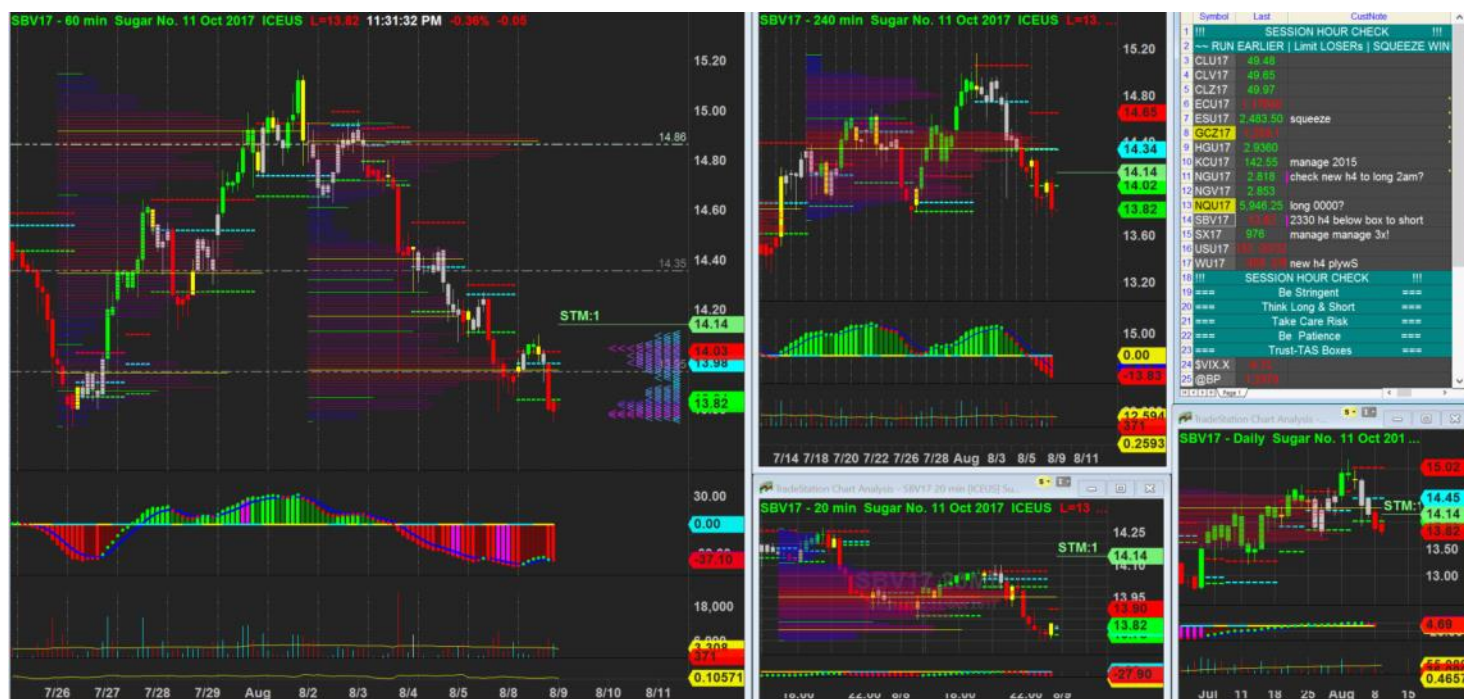
8/8/2017 23:31 - Screen Clipping

Watching to tighten my stop more aggressively as this is chasing a running downtrend