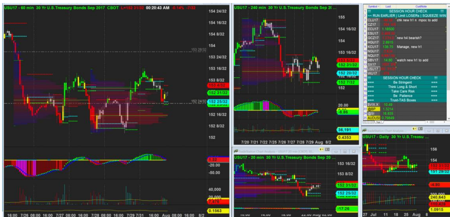
1/8/2017 00:21 - Screen Clipping