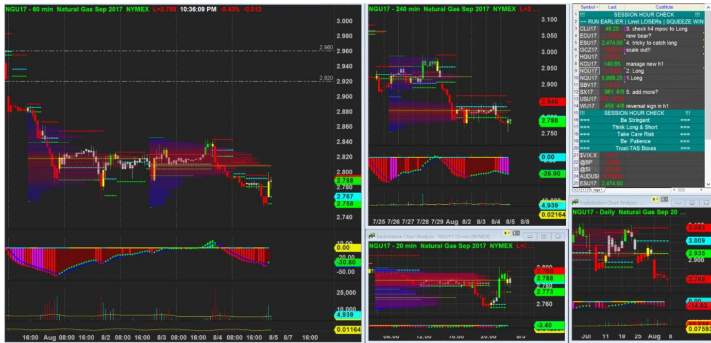
4/8/2017 22:36 - Screen Clipping

I actually need to wait for it to close above h4 mpoc for counter h4 trend, so lets see. Current h4 mpoc is nearer to HVA, a close above mpoc is very near h4 hva, if too near then I will consider wait for it to cross over and do it as follow h4 trend