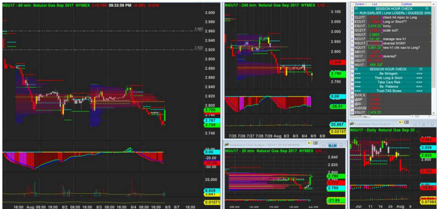
4/8/2017 21:34 - Screen Clipping