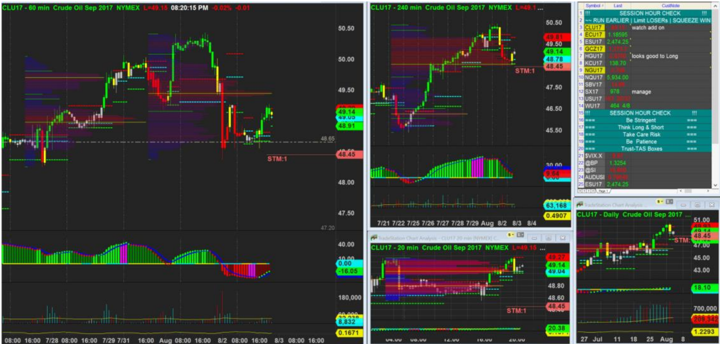
2/8/2017 20:20 - Screen Clipping

Didn't want to add on as even a small risk add-on is not very small the risk. Given this counter h4 trend setup with h4 navi not at perfection ( hitting zero balance line and supported) I will not risk extra lot for now. Waiting for more information.