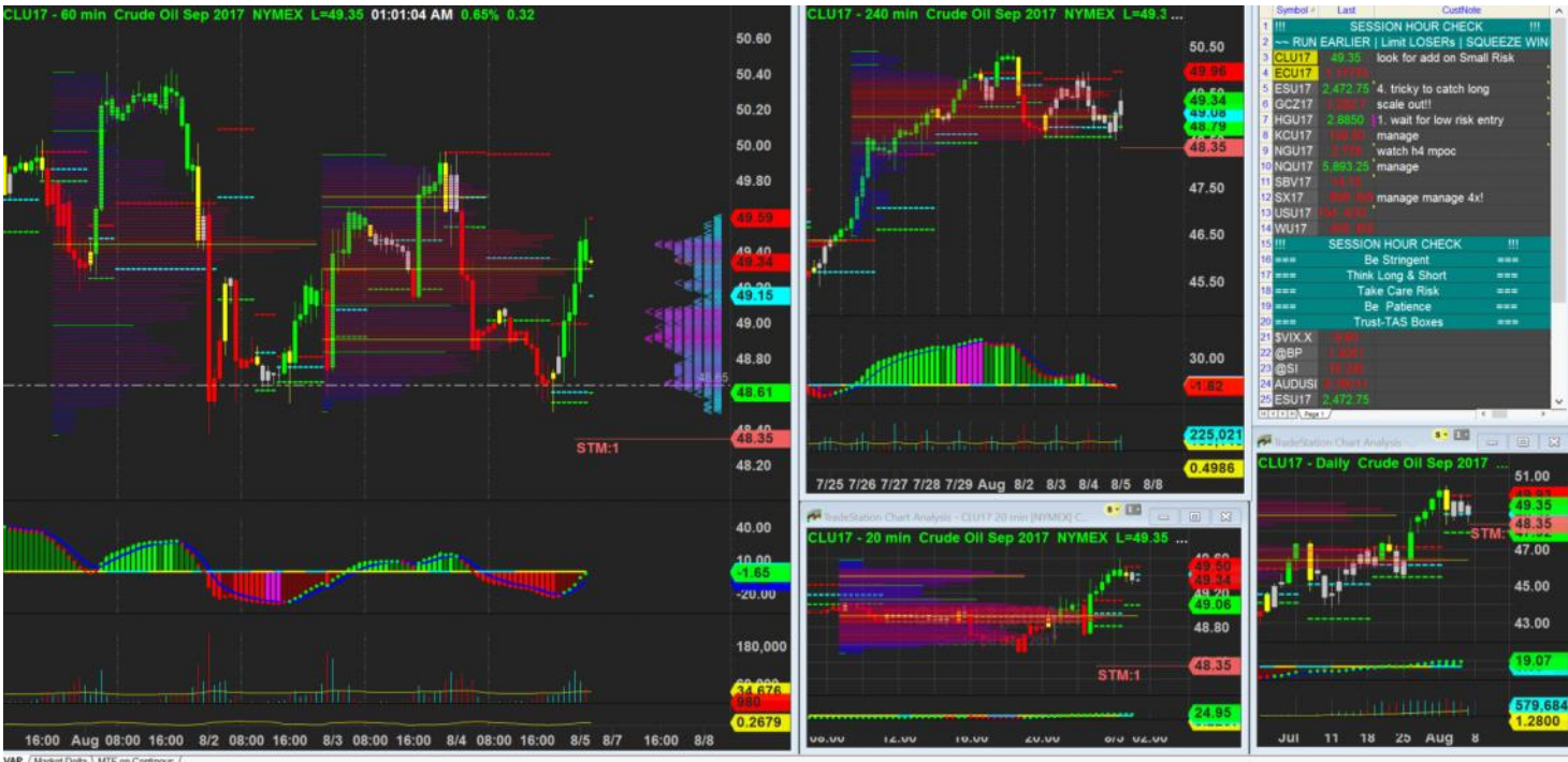
5/8/2017 01:01 - Screen Clipping

Waiting for more info to tighten up my risk.