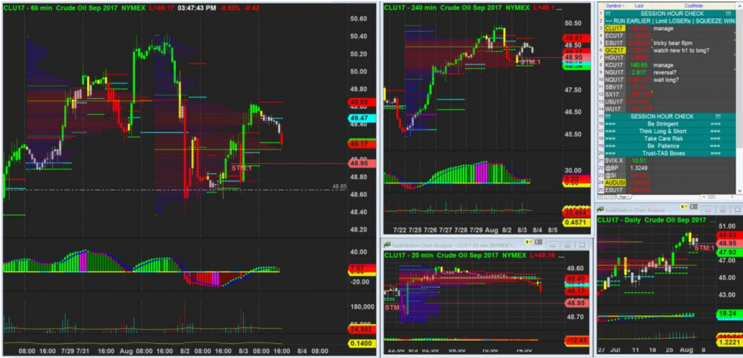
3/8/2017 15:47 - Screen Clipping

100bars mpc shifted up so I tighten a bit more.