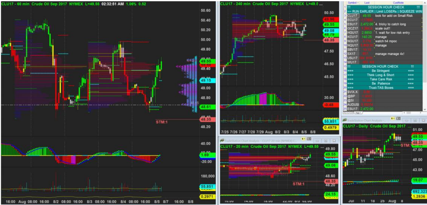
5/8/2017 02:32 - Screen Clipping

Tall box here, I will wait for more info before I tighten.