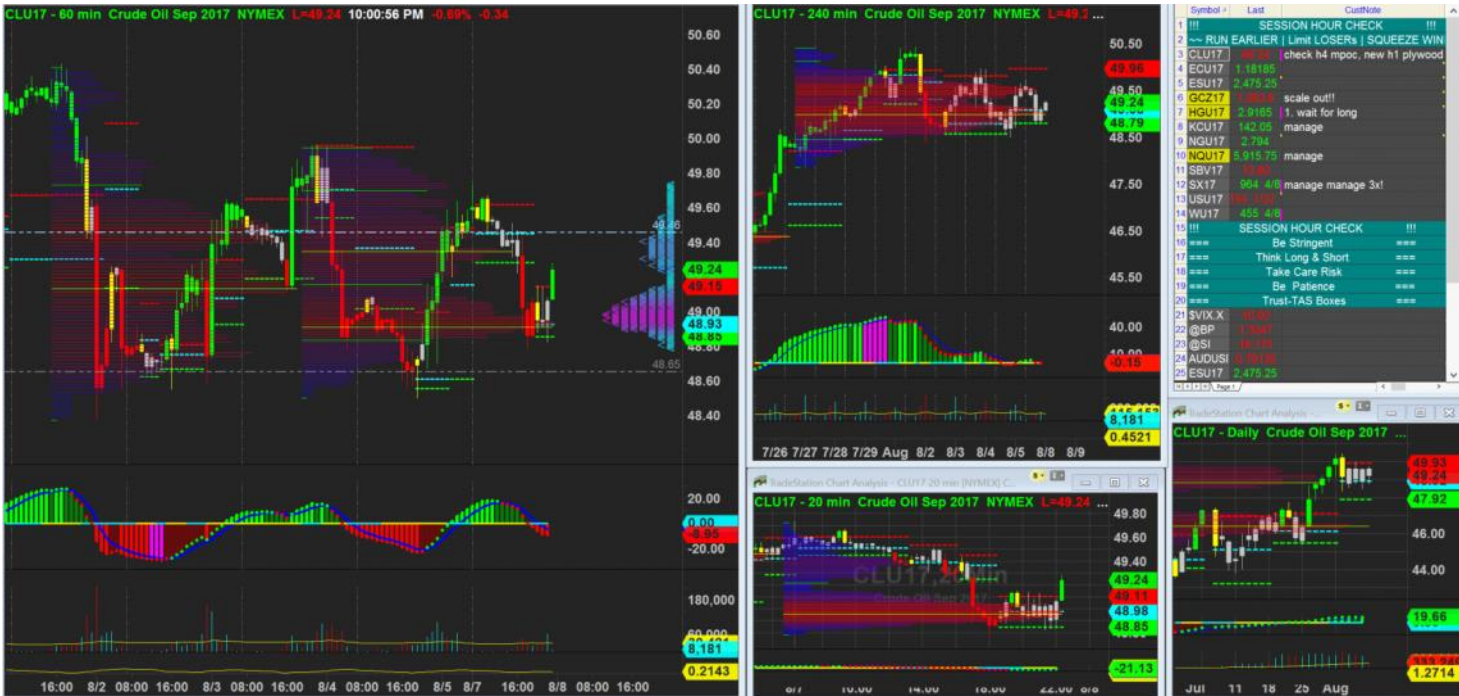
7/8/2017 22:01 - Screen Clipping

Ok it is coming, I m gonna try again. 10pm!